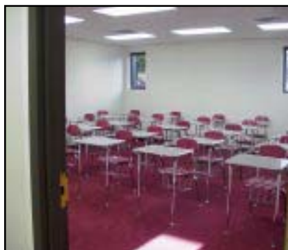
A new classroom located in the lower level of the new wing of the Johnston Center for Performing Arts.

The new addition adds 5,160 square feet to the building and contains two new classrooms, computer labs, restrooms and faculty offices. A state-of-the-art